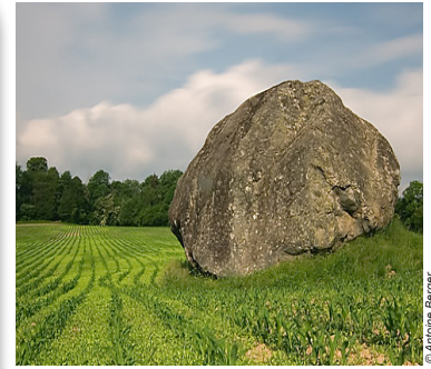
The Pierre à Martin - Ballaison

Geopark Chablais is located in the Haute-Savoie ; it extends from the southern shore of Lake Lemman right up to the summits of the Portes du Soleil. This remarkable natural area impregnates the culture and the life of its inhabitants and its many visitors. The traditional buildings, the use of the mountains, the life in the high alpine farms "alpages", the stories and the legends, the natural riches of the Evian and Thonon Mineral Waters are just some of the examples of the strength of the link between man and nature.